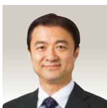
Director and Executive Officer

Representative Director and COO of SBI Investment Co., Ltd. Head of Fund Investments Overseas Business Div.