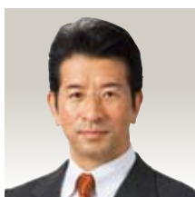
Director and Executive Officer

Representative Director and President of SBI Business Solutions Co., Ltd.