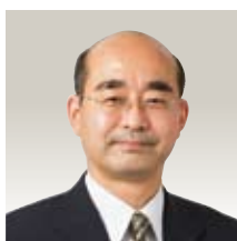
Director and Executive Officer

Executive Officer of Overseas Business Div. and General Manager of Overseas Business Promotion Dept. Director of SBI Investment Co., Ltd.