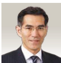
Director and Executive Officer

General Manager of Overseas Business Administration Dept., Overseas Business Div. Director of SBI VEN HOLDINGS PTE. LTD. Director of SBI Hong Kong Co., Limited