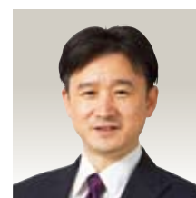
Director and Executive Officer

Representative Director, Executive Officer, and COO of SBI VeriTrans Co., Ltd. Representative Director and Co-CEO of SBI Research Co., Ltd. Representative Director and CEO of SBI Navi Co., Ltd.