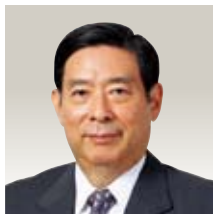
Representative Director and CEO