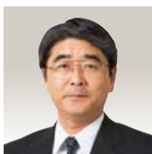
Director and CFO

Director and CEO of SBI VeriTrans Co., Ltd. Director of SBI VEN HOLDINGS PTE. LTD. Director of SBI Hong Kong Co., Limited