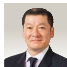
Director and Executive Officer

Representative Director of SBI KOREA HOLDINGS CO., LTD. Representative Director, Chairman and CEO of SBI Investment KOREA Co., Ltd.