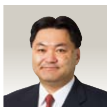
Director and Executive Officer

Representative Director and Chairman of SBI Net Systems Co., Ltd. Director and CFO of SBI Investment Co., Ltd.