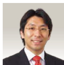
Director and Executive Officer

Representative Director and COO of Morningstar Japan K.K.