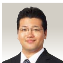
Director and Executive Officer

Representative Director and COO of SBI Mortgage Co., Ltd.