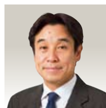
Director and Executive Officer

Chief Representative of the Beijing Representative Office Director of SBI Hong Kong Co., Limited