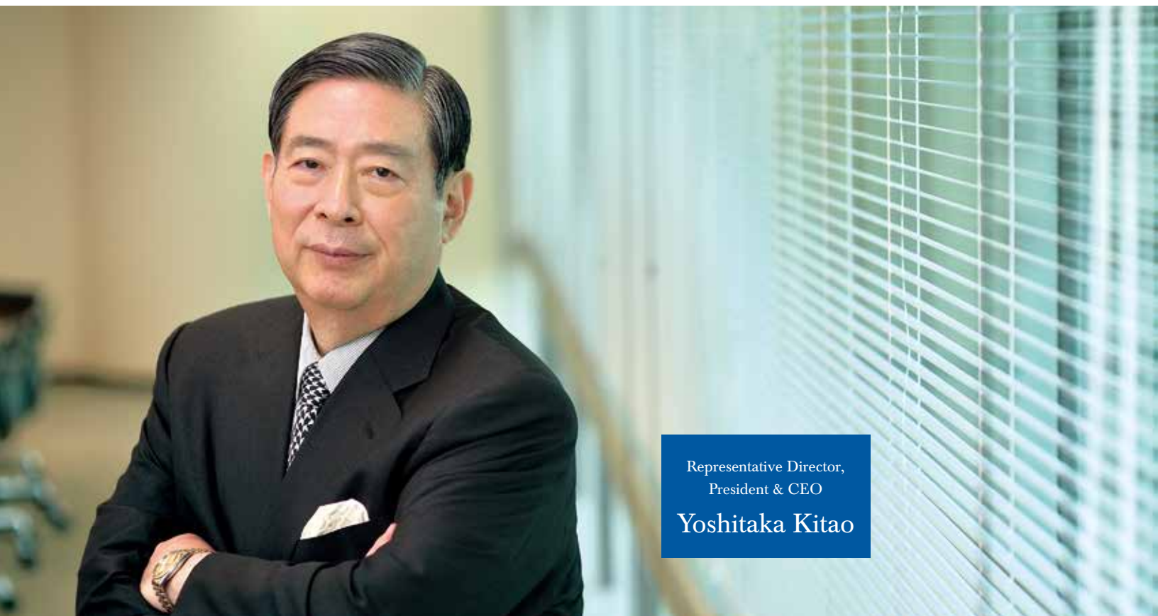
Representative Director, President & CEO